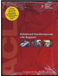
ADVANCED CARDIOVASCULAR LIFE ISBN: 9781616690106